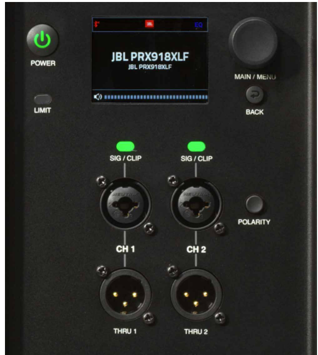
REAR PANEL CONNECTIONS

The JBL PRX918XLF , part of the JBL PRX900 Series powered loudspeakers and subwoofers, takes professional portable PA performance to a new level with advanced acoustics, comprehensive DSP, unrivaled power performance and durability, and complete BLE control via the JBL Pro Connect app.